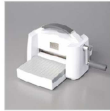
Stampin' Cut & Emboss Machine