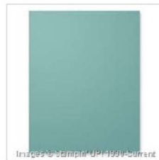
Lost Lagoon 8-1/2" X 11" Cardstock