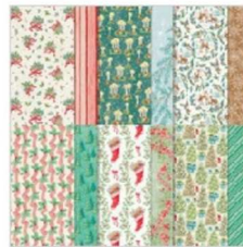
Sentimental Christmas 12" X 12" (30.5 X 30.5 Cm) Designer Series Paper