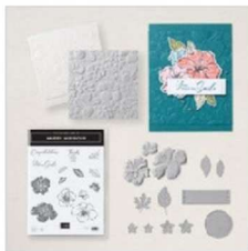
Happy Hibiscus Bundle (English)